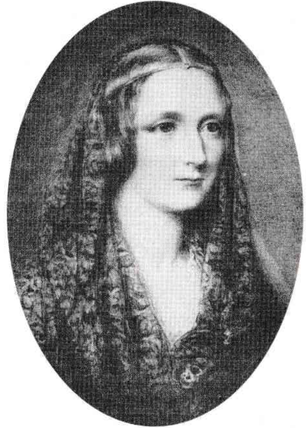
Mary Shelley (1797–1851)